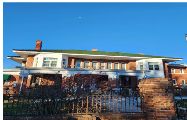
Nearly 2.5 years after the huge HAIL storm.