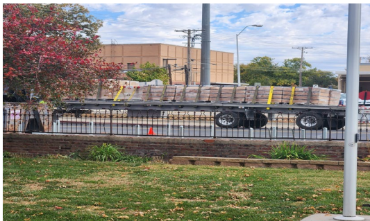
New Roof Tiles Arrive