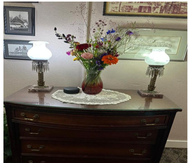
Four of the bouquets were placed in various locations in our Home for ALL to enjoy!